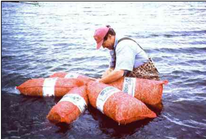
Barley straw being floated in one section of a pond. The porous bags allow water to permeate through the bag, allowing the barley straw to become saturated.