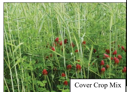
Cover Crop Mix

The cover cop mix is a great fertilizer alternative for a small field or garden! Sow these seeds after harvest to reduce soil loss from erosion. The hairy vetch and winter rye in this mix will regrow in the spring (all other plants will winter kill) and provide nutrients to your crops! (Species include winter rye, field peas, ryegrass, crimson clover, and hairy vetch) Seeding rate: 5 lbs./0.1 acre or ~4300 sq.ft